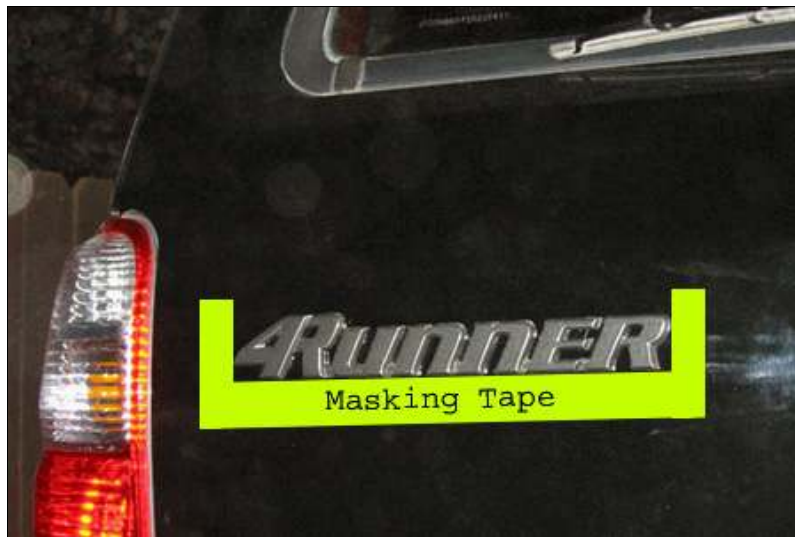
Use masking tape to aid you in reattaching your emblems

Now, take your heat gun and work the gun on the emblem from all side. Do not set it too high or too close. You just want to soften up the adhesive. Next, take some adhesive remover and squirt some of the fluid (from the top down) beneath the emblem. Wait a few minutes and then take your plastic putty knife and slide it behind the emblem. Try to maintain a flat angle and even pressure so as to not damage your paint. As you work your blade under the emblem, slowly and carefully lift up the blade behind the emblem until you feel the emblem coming off. If the adhesive is still too tacky, apply some more heat and/or more adhesive remover.